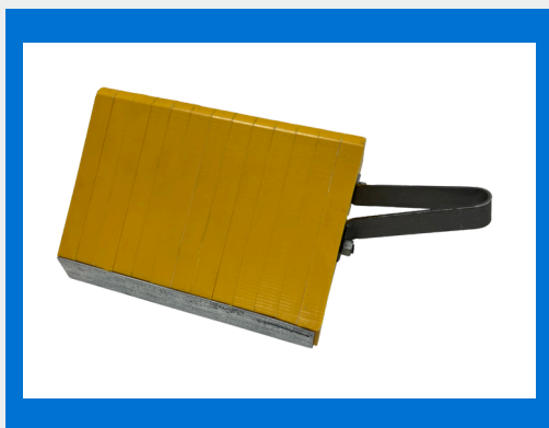
Plastic Wheel Chocks with Steel Tread