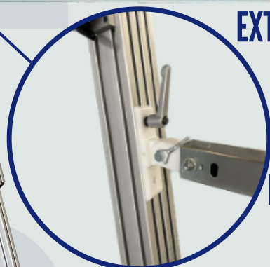
ADJUSTABLE PRESSURE BAR