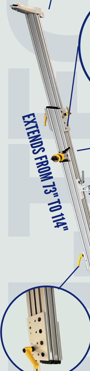
EXTENDS FROM 13" TO 114"