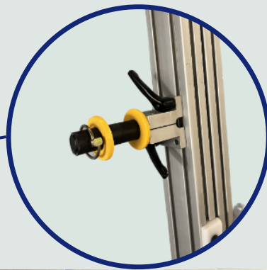
ATTACHMENT BLOCK FOR RayDius QUAD BLOCK OR SHEAVES