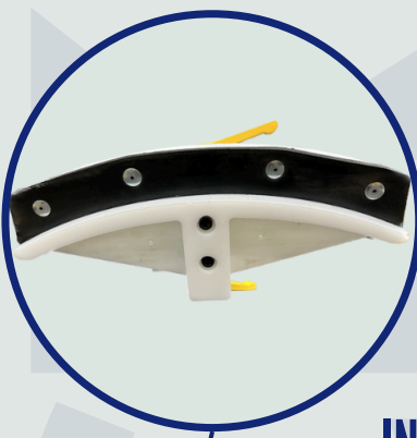
CEILING WEDGE FOR PROPER PRESSURE