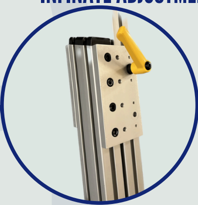
LOCKING LEVER FOR INFINITE ADJUSTMENTS