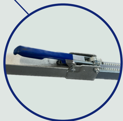
PRESSURE BAR RATCHETING LOCK