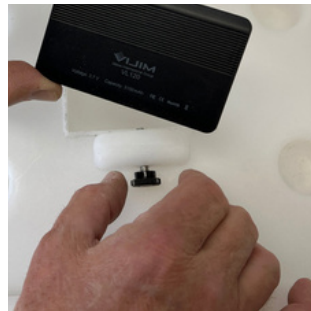
The Light attaches on bottom using the closed Thumb Screw