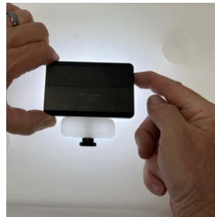
Power on using the switch