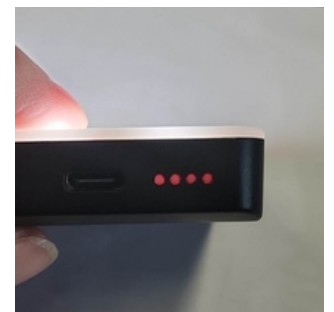
To charge, simply connect to the included charger into the USB-C port