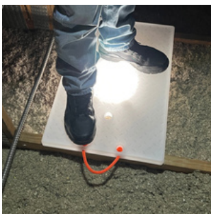
Using HI-VIS handles for transport, position and stand on one unit.