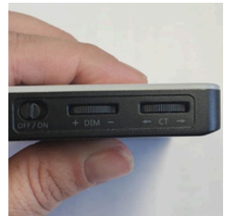
Brightness and color temperature are adjustable using the dials on the side