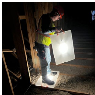
Position the next board at a comfortable distance. Step onto that board.