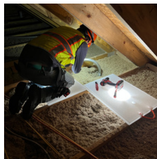
Pick up and reposition the board you just vacated. Repeat.